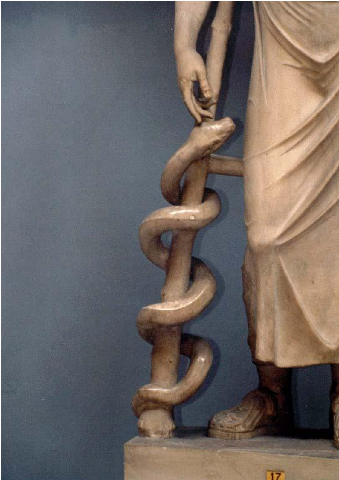
Asclepius, Detail of Serpent