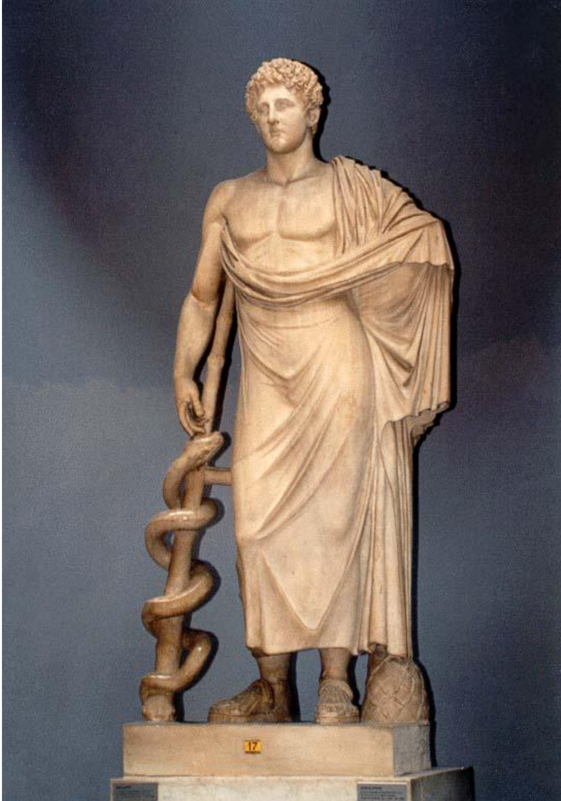
Asclepius, Detail of Serpent